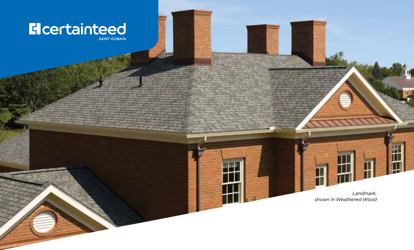
Landmark, shown in Weathered Wood