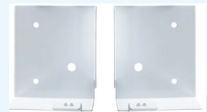
RSK 3080 (Included)