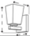
Image File Name: P5042-084.jpg