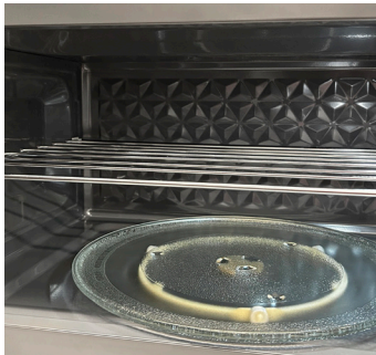
Included Grill Rack for convenient 2-Level Cooking

The Sharp® SMO1969JS features a powerful 4-speed ventilation system and easy-to-reach, easy-to-replace filters. With decades of experience designing innovative cooking appliances, it's easy to see why cooks around the world trust Sharp.