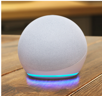
Works with Alexa allows for effortless verbal control over your microwave