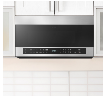
The sleek edge-to-edge stainless steel and black glass design is an elegant look to your kitchen

Product specifications and design are subject to change without notice.