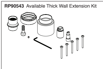
▲ Designate Proper Finish Suffix