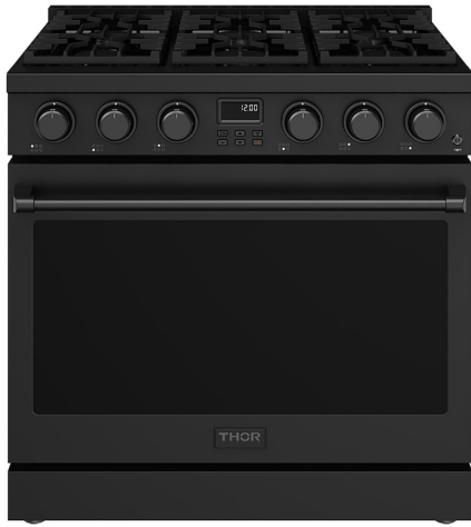
Product: 36-Inch Contemporary Professional Gas Range in Black Model Number: ARG36B/ARG36LPB