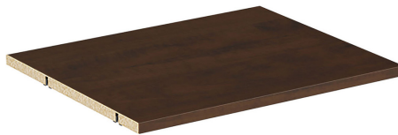
5 - SPC Shelf Kit 18X14