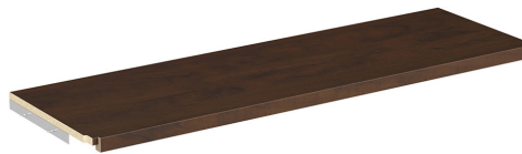
4 - SPC Top Shelf Kit