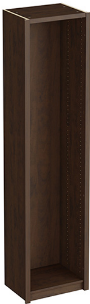
1 - SPC Frame 18X14