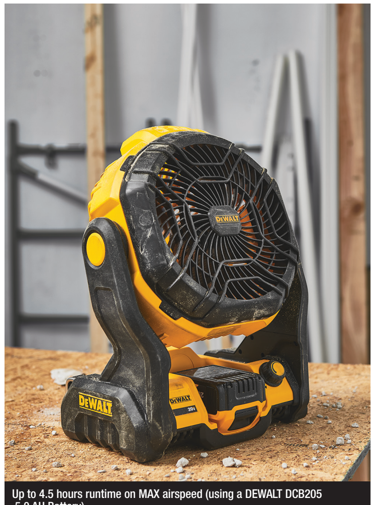
5.0 AH Battery).