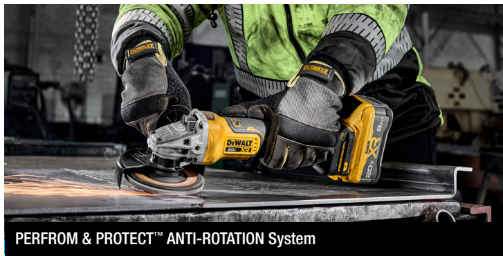
PERFROM & PROTECT™ ANTI-ROTATION System