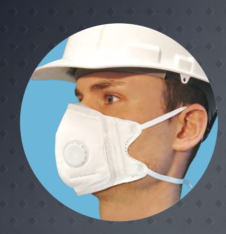
WITH COOLTECH VALVE