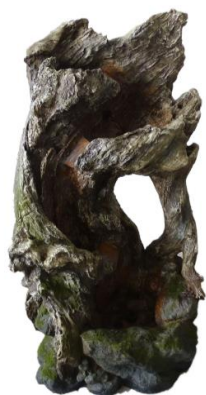
Fountain (3 LED lights pre-installed) 1x