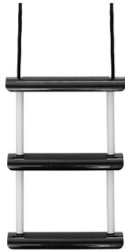
3-Step Ladder x1