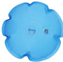
Weight Bag x1 (Blue)