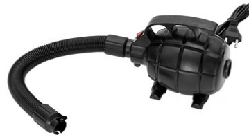
Reversible Air Pump x1