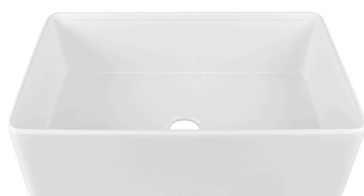
● Farmhouse Kitchen Sink (DV-1K0067)