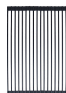
● Roll Up Drying Rack (DV-K0067R02)