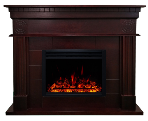
**Shown in the Mahogany finish

Fireplace enthusiasts will enjoy the convenience of an electric unit. It's flexible placement allows you to move it from room to room as needed. It will never produce ash or soot, and the logs will never need to be replenished. No need to for professional installation, simply plug it in and enjoy!