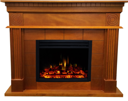
**Shown in the Teak finish