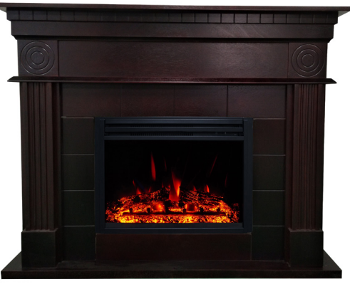
**Shown in the Dark Coffee finish

The Shelby electric fireplace offers the perfect blend of style and functionality to any room it's placed in. The slim, transitional mantel is made out of MDF material, and is available in seven striking finishes. The clean lines, fluted pilasters, and crown molding are a few designer details that add character to this handsome frame.