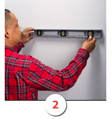
Use a level and tape measure to mark bracket locations.