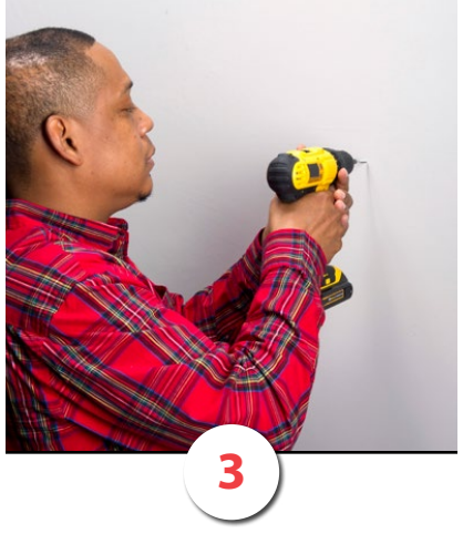
Pre-drill holes and insert screws with drill or screwdriver.