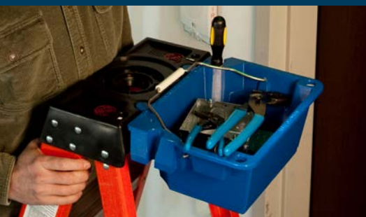
HolsterTop® PRO with lock-in accessories