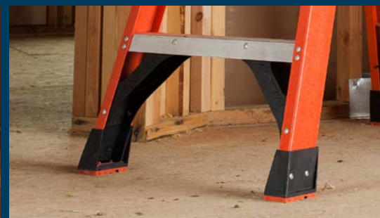
EDGE 360™ bracing