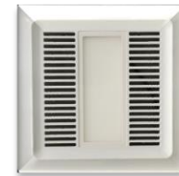
L1 (W) Grille

ETL/cETL Listed for installation over tub/shower enclosure when used with GFCI circuit wiring