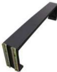
B. Center Cross Supports (2 Pieces)