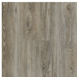
AR7L230W Light Gray