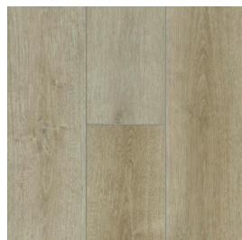
AR7L210W Light Taupe