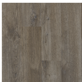
AR6L200W Dark Brown