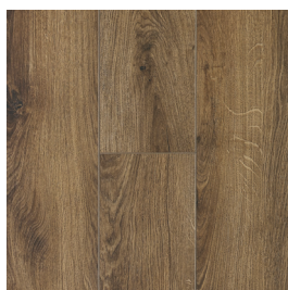
AR7L130W Light Mocha