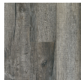
AR7L150W Rustic Brown