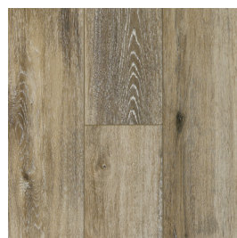
AR7L120W Linen Sand