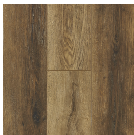
AR7L220W Mist Brown