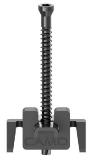
WEDGEMETAL™ FOR ANY DECK PATTERN ON 14-18GA METAL JOISTS