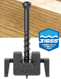
WEDGE™ FOR ANY DECK PATTERN ON WOOD JOISTS