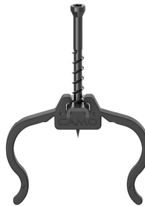
EDGE™ FOR 90° DECK PATTERNS ON WOOD JOISTS