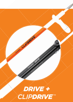
DRIVE + CLIPDRIVE™