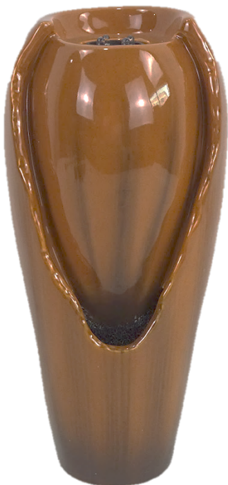
Fountain (LED light pre-installed) 1x