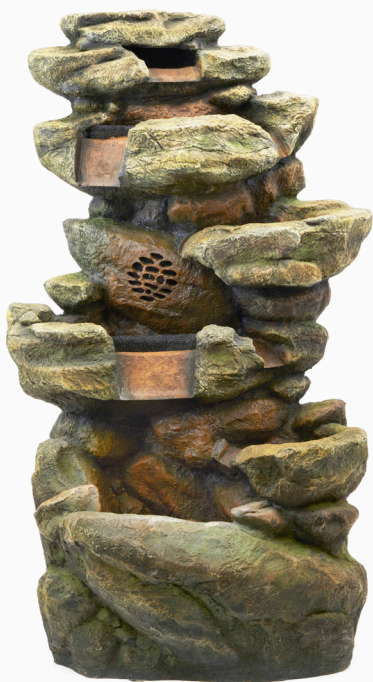
Fountain x1 (LED lights pre-installed)