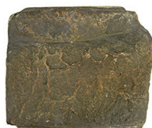
Back Door x1