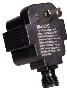
Transformer and Socket Connector x1

*Pump may be packaged separately in an outer box located in the outer Styrofoam packaging.