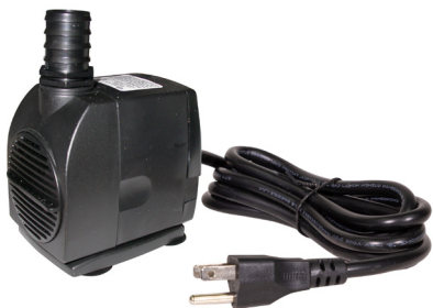
Submersible Pump x1