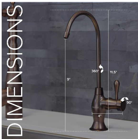
Sequoia, w/ LED filter replacement indicator