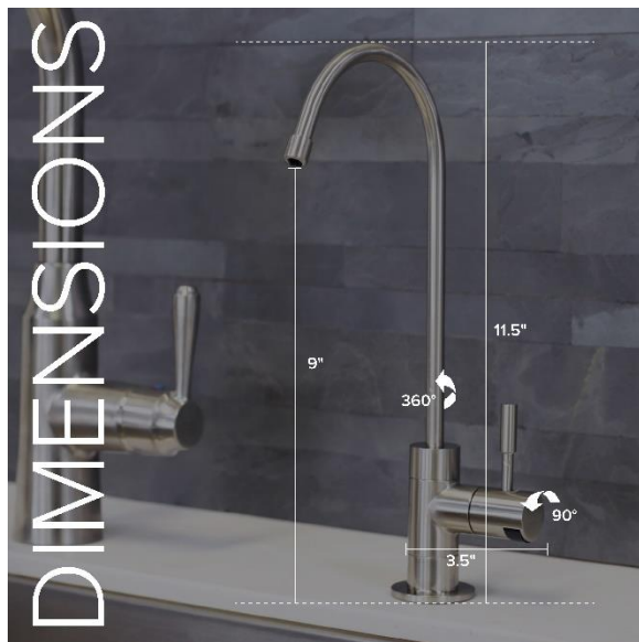
Slake, w/ LED filter replacement indicator