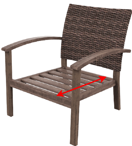
MEASURE DEPTH OF SEAT FRONT to BACK