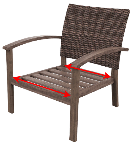
MEASURE WIDTH BETWEEN the ARMS