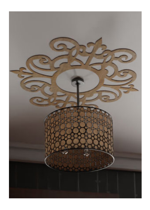
FRONT VIEW SIDE VIEW