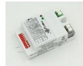
Microwave motion sensor