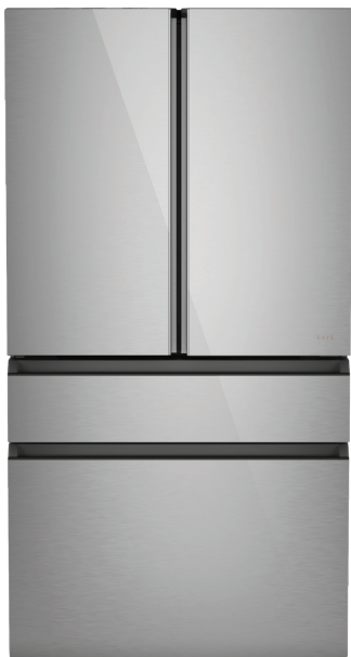
CJE23DM5WS5 Platinum Glass with Integrated Pockets