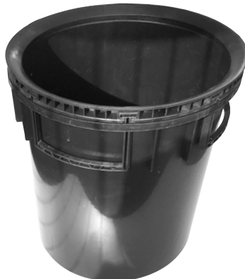
D. PLANT LINER