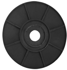
E. PLANT LINER SUPPORT