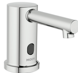
M•Power™ Align® Style Electronic Soap Dispenser