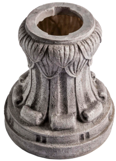
A. Pedestal Base