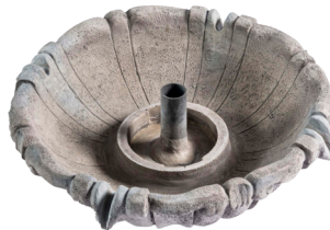
E. Tier 2 Bowl