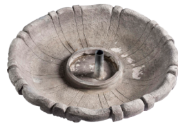
F. Tier 1 Bowl