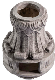
B. Middle Pedestal