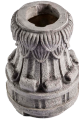
C. Top Pedestal