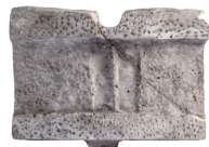
H. Pump House Door