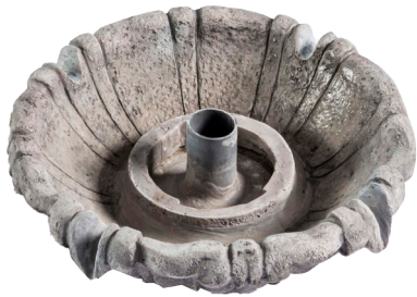
D. Tier 3 Bowl