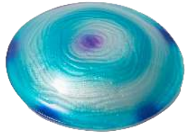
A. Splash Guard