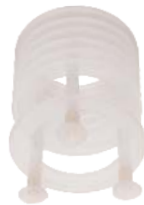
F. Plastic Tower Stand