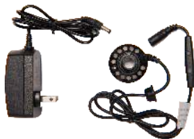
E. Fogger Unit and Power Adapter