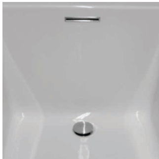
Linear Integral Waste and Overflow