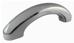
Standard Grab Bar