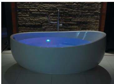
Chromatherapy-LED Lighting System