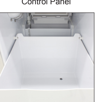
Ice Storage Bin