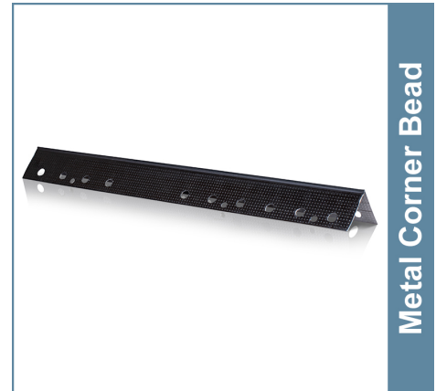
Metal Corner Bead