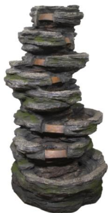
Fountain (7 LED lights pre-installed)