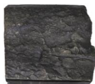
Fountain Back Door