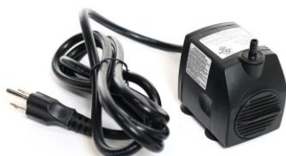
Submersible Pump 1x