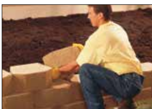
3. Install Additional Courses

Backfill first course units with clean granular fill material (i.e. crushed stone/gravel). DO NOT USE PEA GRAVEL! Compact with hand tamper or appropriate mechanical compactor. Backfill and compact behind each course before installing additional courses.