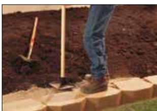
2. Place & Compact Backfill

At wall location, dig shallow trench for wall base (see Typical Wall Section). Place granular leveling pad material. Compact and level the base pad. Place and level the first course units. If grade changes along base of wall, create stepped leveling pad as required. Always start wall at lowest elevation, working to highest. Complete base course before proceeding with additional courses.