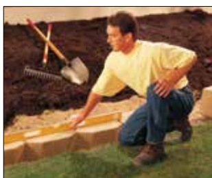
1. Prepare Wall Location

At wall location, dig shallow trench for wall base (see Typical Wall Section). Place granular leveling pad material. Compact and level the base pad. Place and level the first course units. If grade changes along base of wall, create stepped leveling pad as required. Always start wall at lowest elevation, working to highest. Complete base course before proceeding with additional courses.