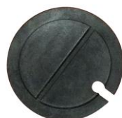
Fountain Back Door 1x