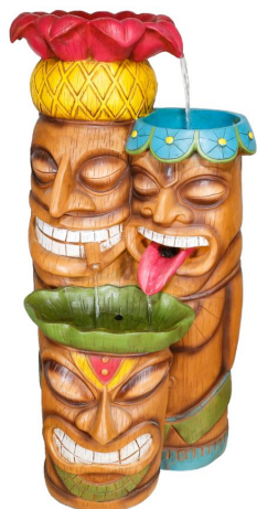
Fountain (3 LED lights pre-installed) 1x