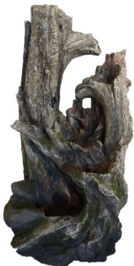
Fountain (3 LED lights pre-installed) 1x