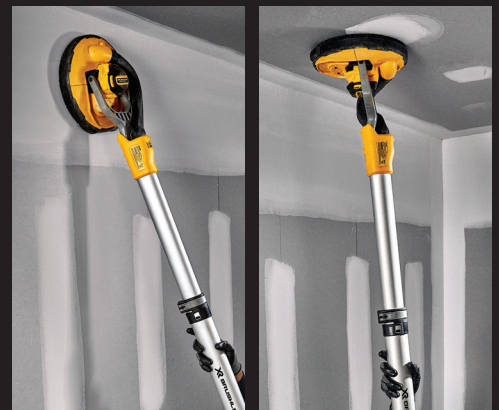
Telescoping shaft and articulating head for hard to reach areas.