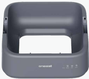
Base Unit x1