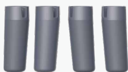
Support Legs x4