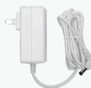
Power Adapter x1