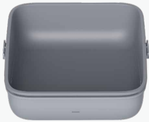
Litter Tray with Full-Cover Litter Pad x1