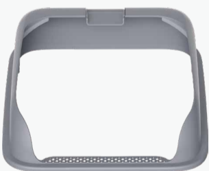
Litter Tray Lid x1