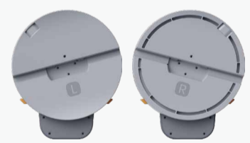
Left /Right Drive Box x1