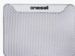
Cat Litter Mat x1