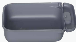
Waste Drawer x1