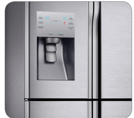
Clean, Modern Design