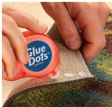
SECURE AREA RUGS