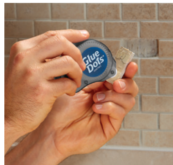
FAST TILE REPAIRS