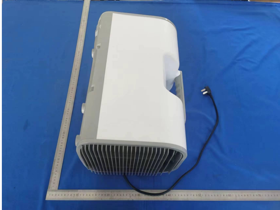
Photo 3 General appearance of EUT