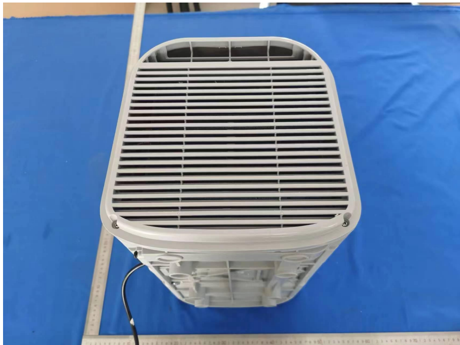
Photo 4 General appearance of EUT