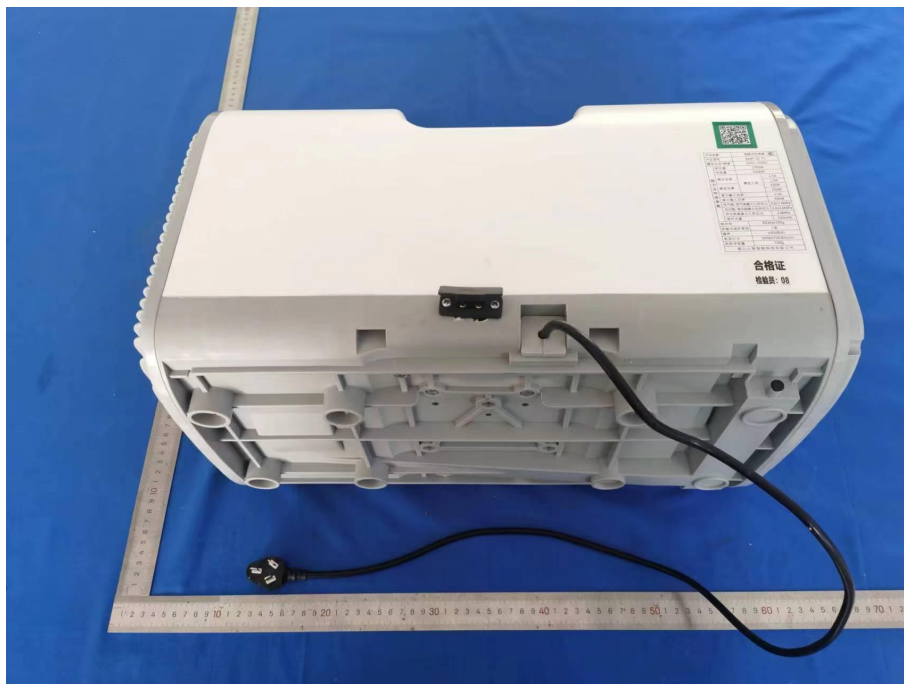
Photo 2 General appearance of EUT