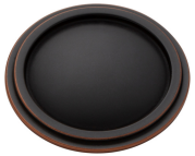
Oil Rubbed Bronze - RL021644