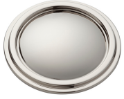
Polished Nickel - RL021637