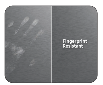
Fingerprint Resistant Finish