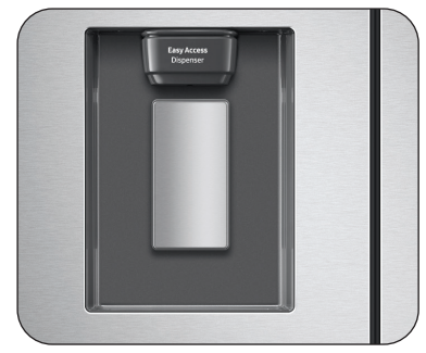
External Water Dispenser

Fingerprint Resistant Black Stainless Steel