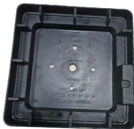
B. Self-Watering Tray