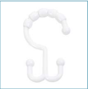
Plastic Beaded Double Hooks