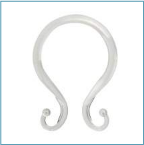
Plastic Double Shower Hook