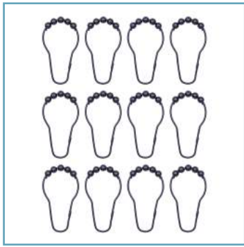
Set of 12

Each Shower ring and hook comes in a set of 12.