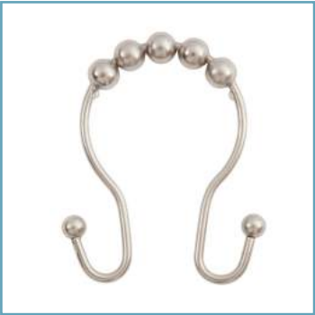
Beaded Roller Double Hook