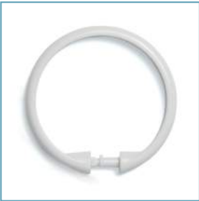
Plastic Shower Ring