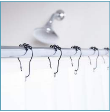
Roller Ring Glide

Each Shower ring and hook comes in a set of 12.