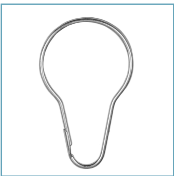
Metal Shower Ring