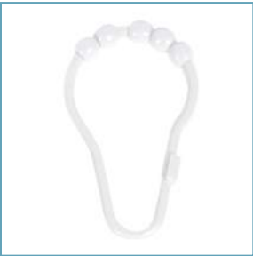
Plastic Beaded Roller Ball Ring