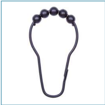
Metal Beaded Roller Ball Ring