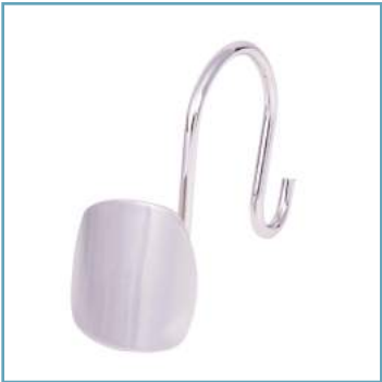
Decorative Double Shower Hook