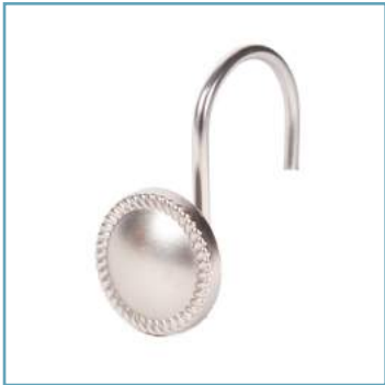
Decorative Shower Hook