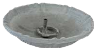
B. Main Bowl