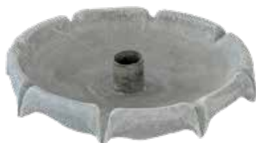
D. Top Bowl