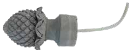
C. Fountain Top