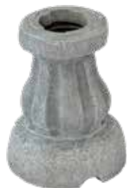
E. Top Pedestal