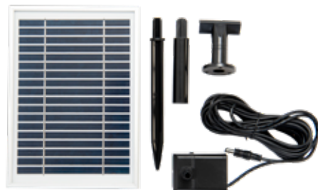
F. Solar Pump