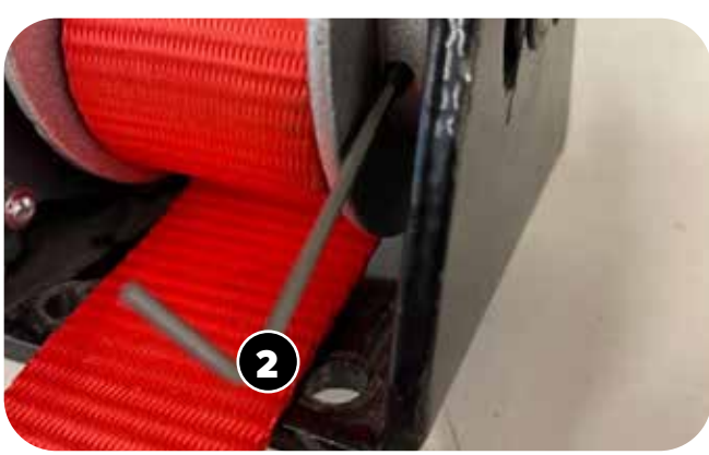
Remove the screw using an allen key 2 and set aside. Do not lose the screw, as you will need it to reinstall your new winch strap.