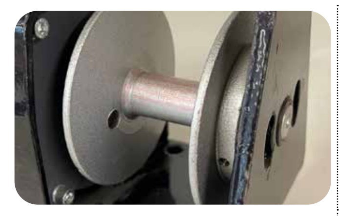
You've now successfully removed your old winch strap. Now it's time to take your new winch strap and reverse the steps above to complete your winch strap replacement.

NOTE: When re-installing the new winch strap, make sure the pin is inserted the correct way.