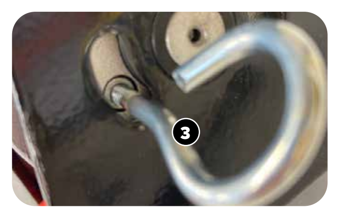
Use the tool that was provided in your plow kit 3 to begin removing the winch pin (you may be able to use needle nose pliers as well)