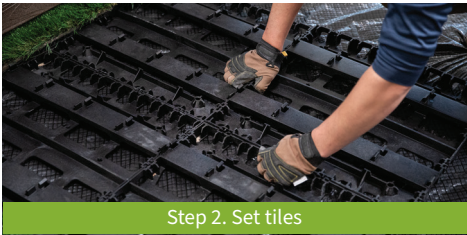
Step 2. Set tiles