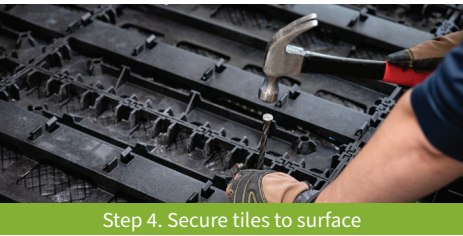
Step 4. Secure tiles to surface