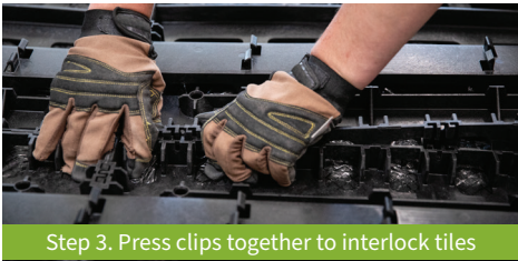
Step 3. Press clips together to interlock tiles