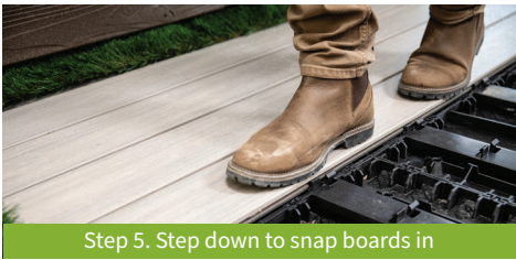
Step 5. Step down to snap boards in