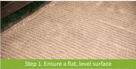
Step 1. Ensure a flat, level surface